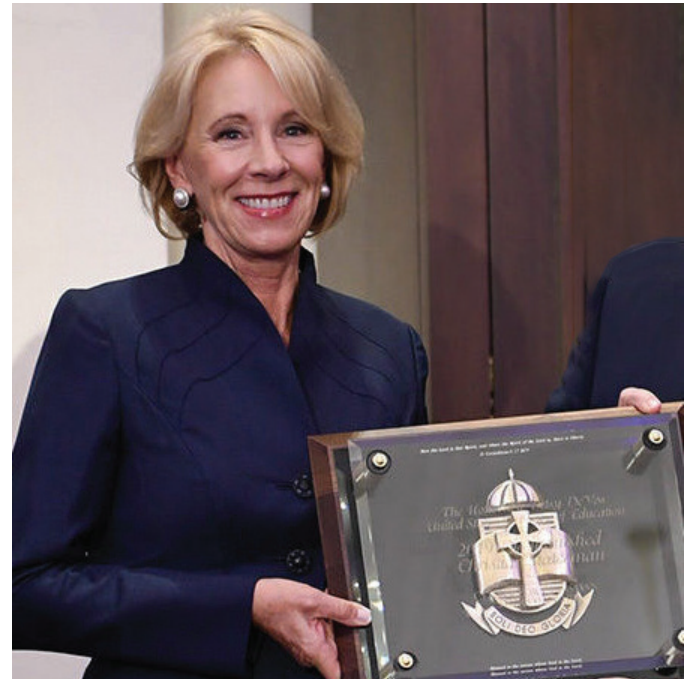
Secretary of Education Betsy DeVos

Each year the Board of Directors prayerfully selects a recipient whose public service and private life uphold these ideals. Since the award's inception in 1996, an annual reception or dinner has been held each year to recognize the recipient.