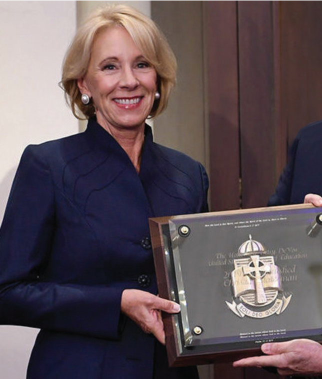
Secretary of Education Betsy DeVos

Each year the Board of Directors prayerfully selects a recipient whose public service and private life uphold these ideals. Since the award's inception in 1996, an annual reception or dinner has been held each year to recognize the recipient.